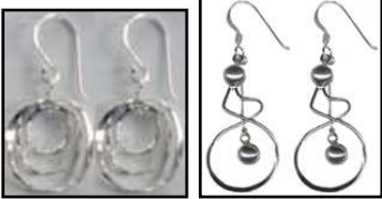
E947 - $12 E610A - $9

E947 a "grown-up" and somewhat more sophisticated version of our most popular earring of all time, E610A.